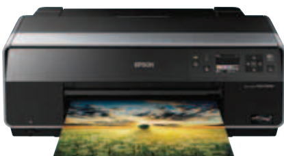
Epson Stylus® Photo R-Series

Enjoy unrivalled colour print quality and speed with Epson Stylus® Photo R-Series.