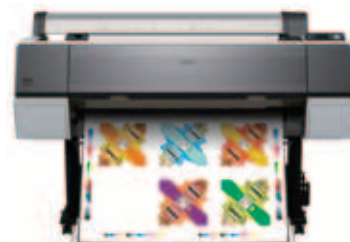
Epson Stylus® Pro Large Format Printers

Enjoy unrivalled colour print quality and speed with Epson Stylus® Photo R-Series.